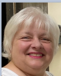
Bev Esala Lake Country