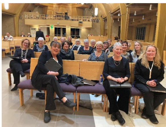
Lake Country Chorus and guest singers are relaxing before our Christmas concert in Anoka.

Some of these new singers started as guests on the risers with us at our traditional Holiday concerts in Anoka and Roseville. We partner with North Star Chorus and this year had a mixed quartet, a husband and wife duo and our own VLQ as part of the entertainment.