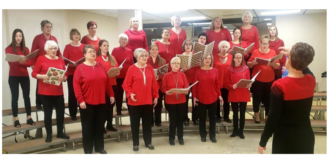
Jingle and Mingle recording with guests

We started the new year with a chorus survey, review and goal setting evening. RRC has chosen not to participate in Regional Competition in 2023, but has decided to focus on presenting a Spring Show, "Grandma's Attic", which was postponed from last Fall, now scheduled for May 6th at Simle Middle School, Bismarck ND. Save the date!