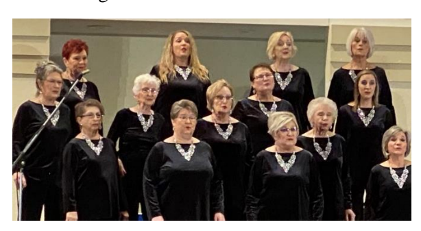
RRC Christmas concert

Then our guests performed with us at our annual Christmas concert on December 18th. We had a great audience and enjoyed fellowship and Christmas goodies after the show.