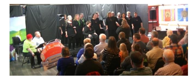
Every summer we sing the US National Anthem, and sometimes the Canadian one as well, at an

We also sang at the Moorhead Cruise night in the parking lot of the Moorhead Center Mall. We received so many compliments! We also connected with the announcer for the event, who happened to be a local radio DJ. He invited us to come on his program any time we wanted to. He showcases unique local talent and was really impressed with our chorus and our history with Sweet Adelines.