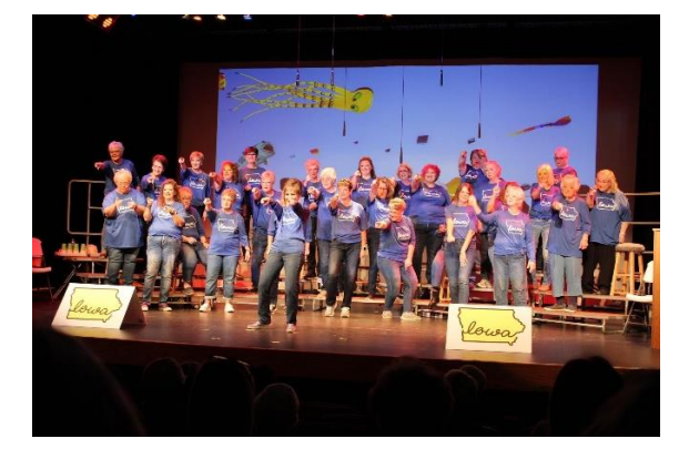
The second half showcased our quartets!

We started with our fall show, "Let's Sing Again" on October 1st at the Pearson Lakes Art Center. What a thrill, performing in an amazing venue in front of a live audience. The first half of our show highlighted Iowa and was filled with corn jokes. We are the Tall Corn State, so corny jokes seemed quite fitting!