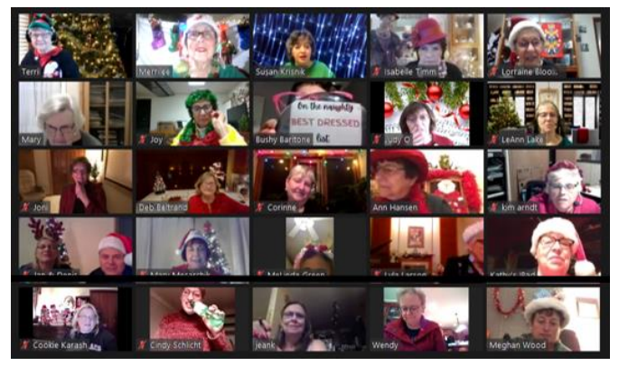
The Price is Right game

Our virtual holiday party consisted of our own background decorations, favorite 'finger food' and beverage, a holiday hat-themed contest (Most 'Sparkly', Best Themed and Wackiest categories), several games - Guess the Song (hummed holiday tunes), The Price Is Right (TC style), and a "12 Days of Christmas" sing-along (with our own hand-drawn flash cards). We also watched and listened to the Christmas Card we