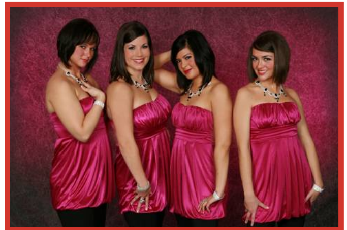
Clicking photos on this page will link to video clips of these performances